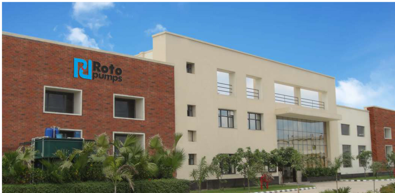
Melbourne Office & Warehouse

Roto Pumps Limited, Manufacturing Plant, India