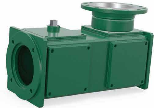
6 Opening Pump Housing