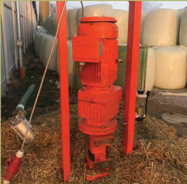
LIQUID MANURE PUMP Flow – 40 m³/hr, Pressure – 4.5 bar