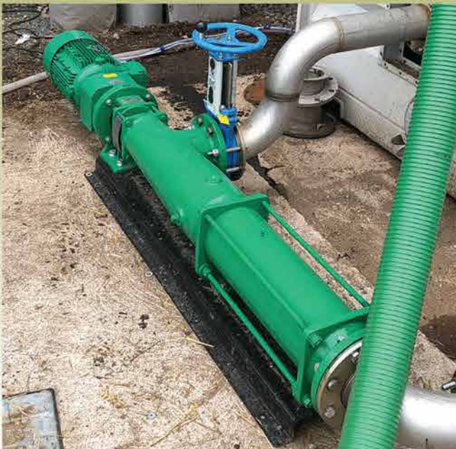
BIOMASS TRANSFER PUMP Flow – 40 m³/hr, Pressure – 3 bar