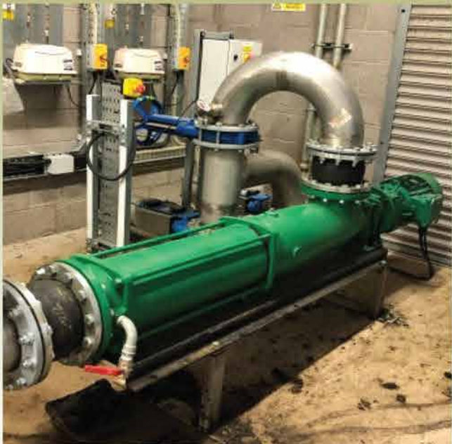
BIOMASS RECIRCULATION PUMP Flow – 80 m³/hr, Pressure – 4 bar