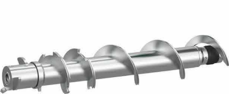
Large Auger - Feed Screw

Designed for crushing & mixing of dry to wet media and feeding of substrate. Option available in plasma nitrided coating.