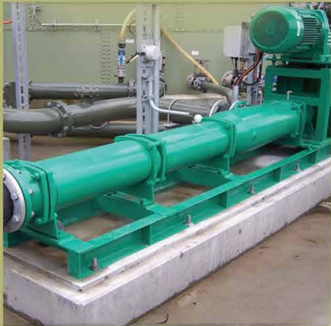
DIGESTATE TRANSFER PUMP Flow – 75 m³/hr, Pressure – 10 bar