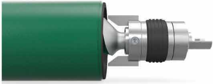
Antiblock (Sweeper) Arrangement